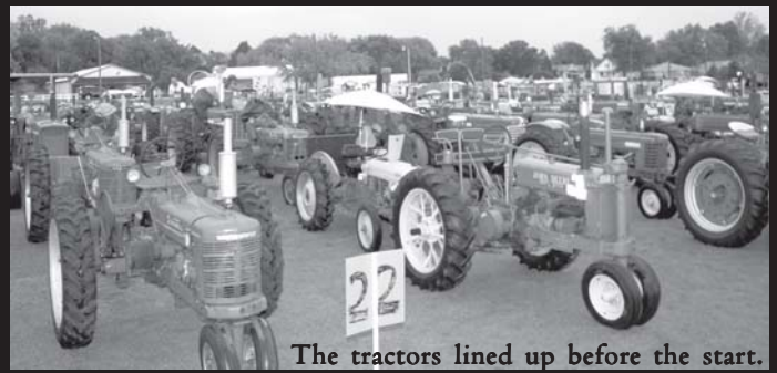
The tractors lined up before the start.

Rain or shine the tractor ride went on without a hitch. It downpoured early that morning, but by 8:00 am when the ride was to start, the rain had stopped. Many riders were prepared with their rain coats and umbrellas in hopes they wouldn't have to use them. KTIC 840/107.9 The Bull put the sixth annual event together and had over 200 tractors show up. The riders are primarily from Nebraska and Iowa but also travel from South Dakota, Colorado, Kansas, Oklahoma, Michigan, Tennessee, Kentucky, Alabama and Florida. The drivers were full of smiles and big stories before the two day event began.