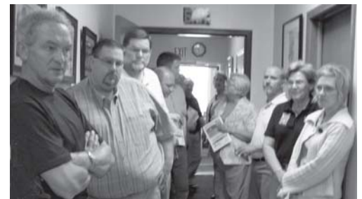
People awaiting the tour through the factory.

Did You Know? Cuming County Public Power District has 1,537 miles of line, which would extend from West Point, NE to Los Angeles, CA. There are 2.54 CCPPD customers per mile of that line.