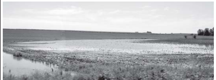
A field just North of Dodge.

Rain and flooding upstream mid-June caused the banks of the Elkhorn River to swell and cause damage along it's course of travel. Two bridges in the area were damaged and many roads were closed for extended periods of time. Area fields were also flooded by the amount of rain in such a short period of time.