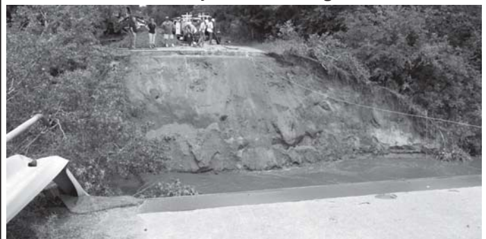
The bridge over the Elkhorn River South of Wisner.