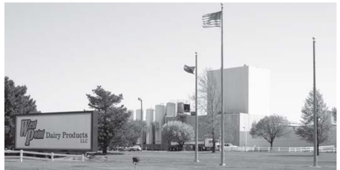
West Point Dairy Products LLC, South of West Point

West Point Dairy (located in the former Tyson facility just South of West Point) is running strong. They have 85 employees and hope to expand as there is need. They make 80-100 different labels for the butter that they ship to places all over the United States. The butter takes 48 hours to be made from the time the cream comes in until the butter is ready to be packaged. West Point Dairy opened their doors for their open house Sunday, June 28 from 1-3pm.